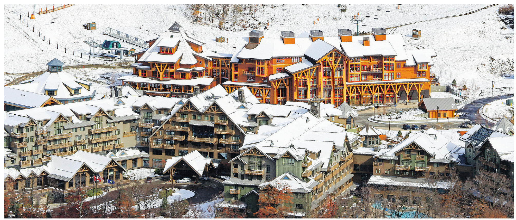
The new Adventure Center is seen behind Stowe Mountain Lodge, dusted with the season's first snowfall last month.